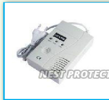
Wireless Gas Detector