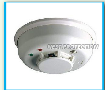
Wireless Smoke Detector