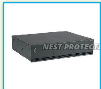
LPG Gas Leakage Sensor