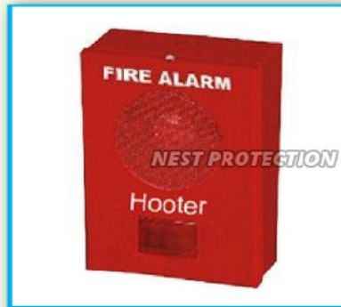
Mild Steel Fire Alarm Hooter