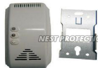
LPG Gas Leakage Sensor