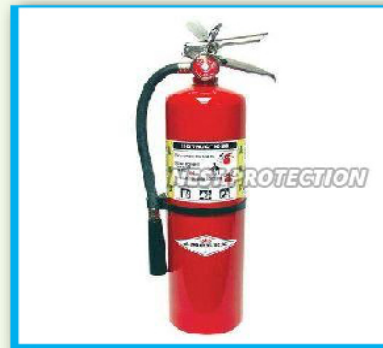
Safex Fire Extinguisher