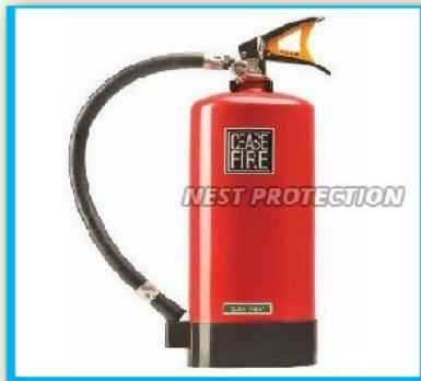
Clean Agent Fire Extinguisher