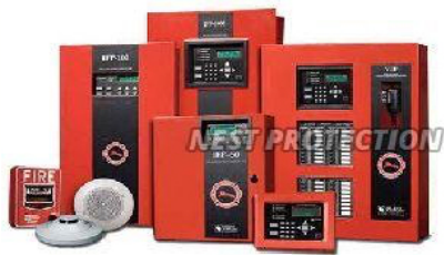
Addressable Fire Alarm System