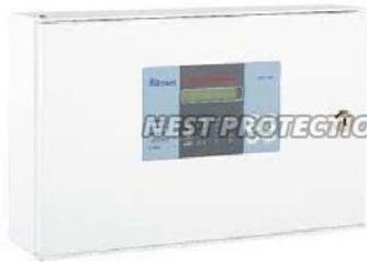
2 Zone Conventional Control Panel