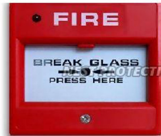
Addressable Manual Call Point