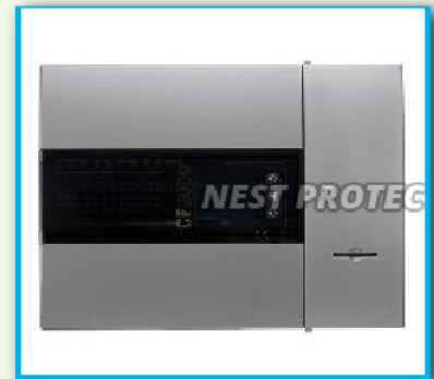
Analogue Addressable Control Panel