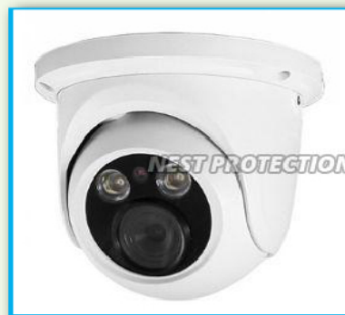
CCTV IP Dome Camera