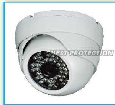
CCTV Dome Camera