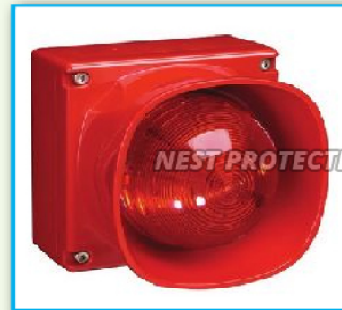
Wall Mounted Sounder Beacon