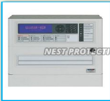
Four loop Fire Alarm Control Panel