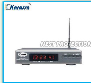
Wireless Fire Alarm Control Panel