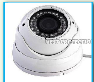
CCTV Analog Dome Camera