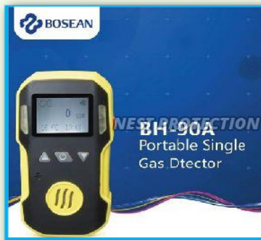
Bosean Gas Detector