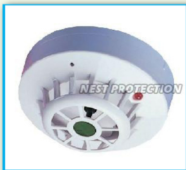
Electric Heat Detector