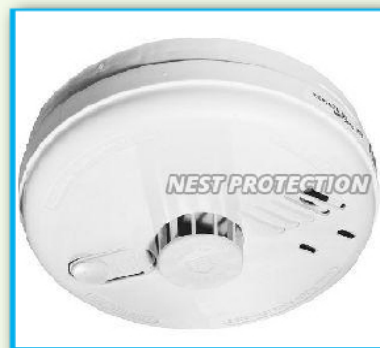
Wireless Heat Detector