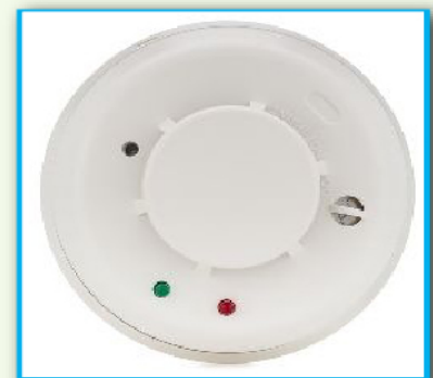
Smoke & Heat Detector