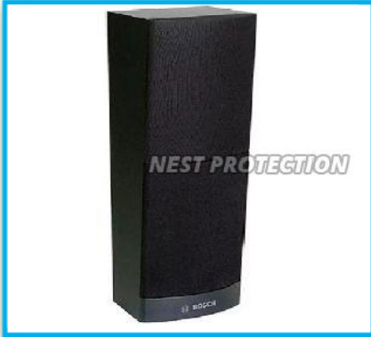
2 Zone Conventional Control Panel