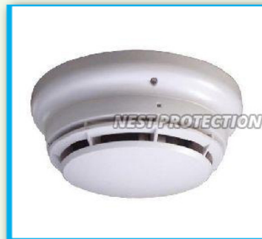
Addressable Smoke Detector