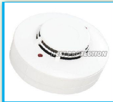
Ravel Smoke Detector