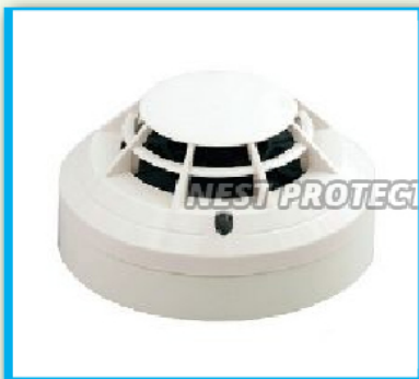
Multi Sensor Smoke Detector