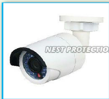
CCTV IP Bullet Camera