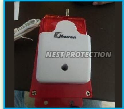
Addressable Manual Call Point