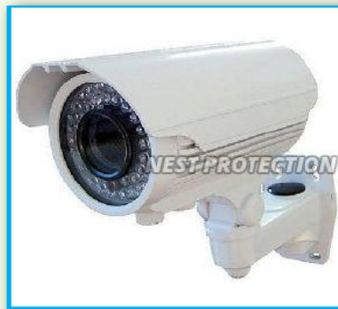
CCTV Bullet Camera