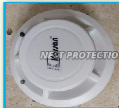
Karsan Smoke Detector